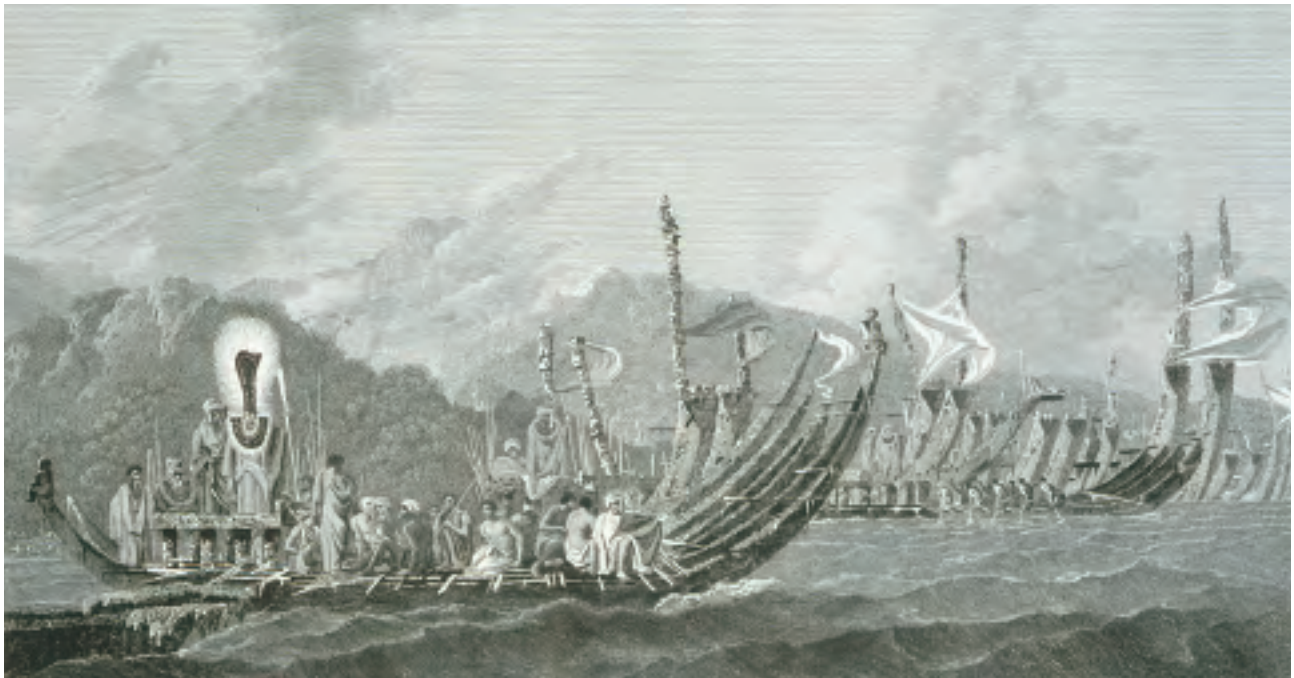
William Woollett, engraver (1735–1785), after William Hodges (1744–1797), The Fleet of Otabeite Assembled at Oparee London: Wm. Strahan & Thos. Cadell, 1 February 1777, engraving; plate mark 24.7 x 39.5 cm