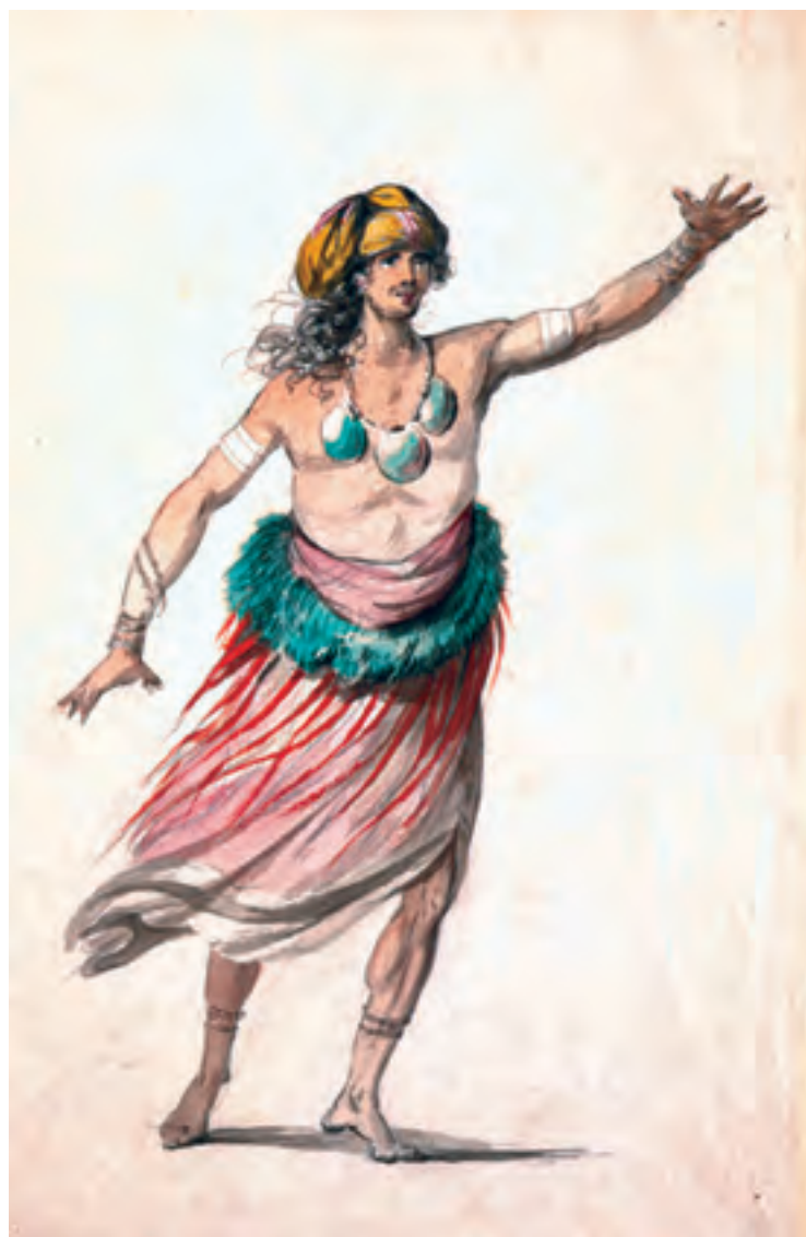
Philippe Jacques de Louterbourg (1740–1812), Dancer, Otaite 1785 watercolour; 31.3 x 20.3 cm