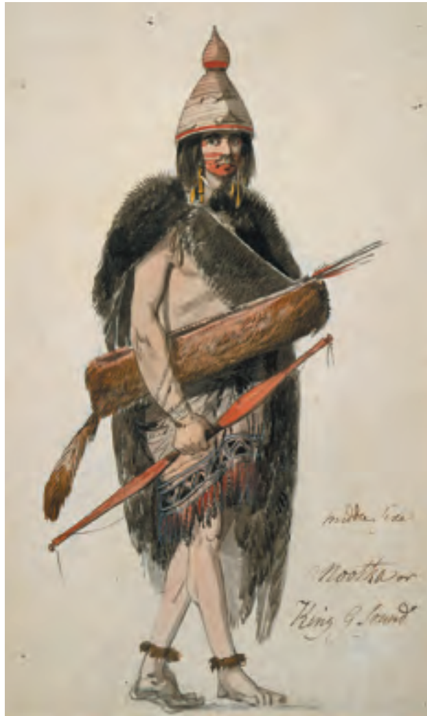
Philippe Jacques de Loutherbourg (1740–1812) Nootka or King G. Sound 1785, watercolour; 31 x 19 cm

Von la Roche began her quest on 7 September with a visit to the British Museum in Bloomsbury, which had