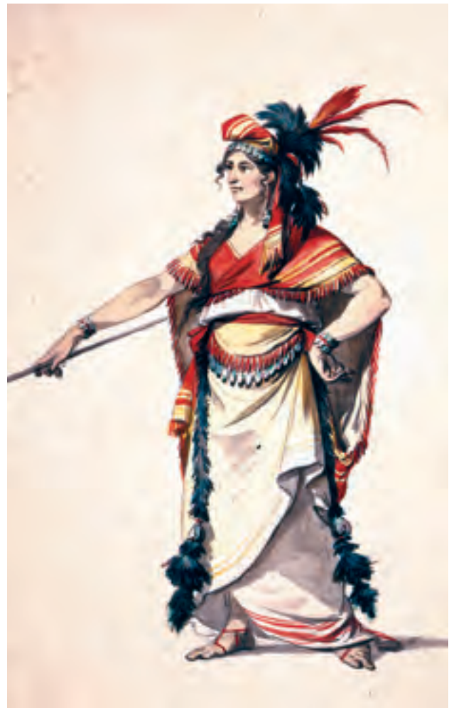
Philippe Jacques de Louthembourg (1740–1812) Obereyau [i.e. Oberea ] Enchantress 1785, watercolour, 32.2 x 20.2 cm

Historians have tended to echo the opinion of the Times reviewer on the subject of the pantomime's scenic authenticity. In a pioneering article of 1936 William Huse argued that each individual travel scene of the pantomime was based scrupulously on individual plates