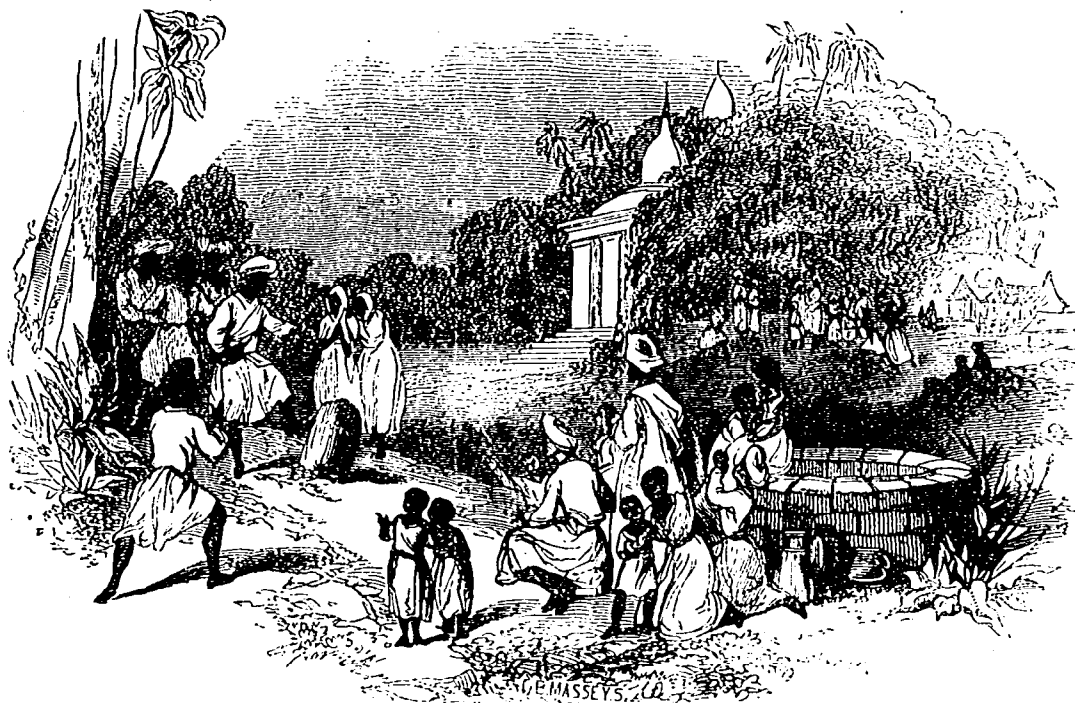
THE IDOL-GOD REJECTED.