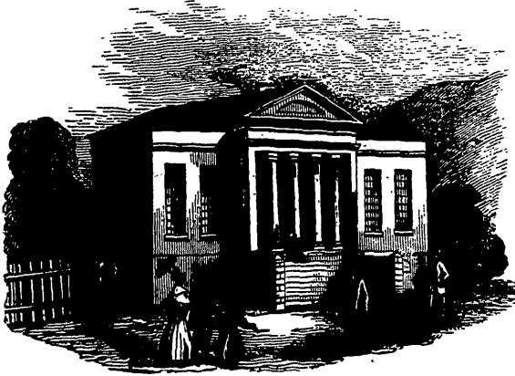
COURT-HOUSE, GRAHAM'S TOWN.

at least. Its position is in a fine and improving country, and its public buildings are very creditable.