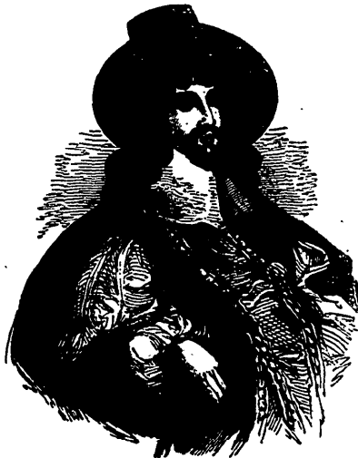
PORTRAIT OF JOHAN VAN RIEBECK.

We annex a portrait of the founder and first Governor of the colony of the Cape of Good Hope, from his picture in the Town Hall at Cape Town.