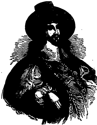
PORTRAIT OF JOHAN VAN RIEBECK.

We annex a portrait of the founder and first Governor of the colony of the Cape of Good Hope, from his picture in the Town Hall at Cape Town.