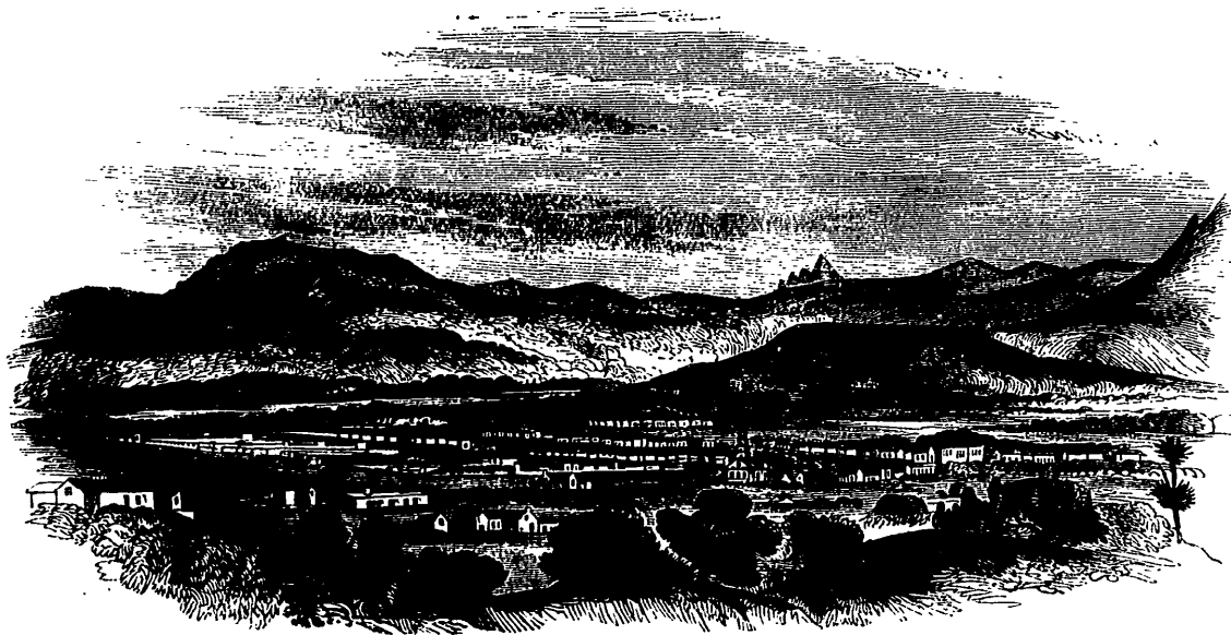
TOWN OF UTENHAYE.