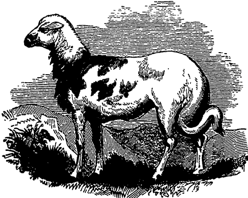
ORIGINAL CAPE BREED OF SHEEP.

all that seems to be desirable. The sheep are no longer the long fat-tailed kind that used to be so much talked of, but are now o