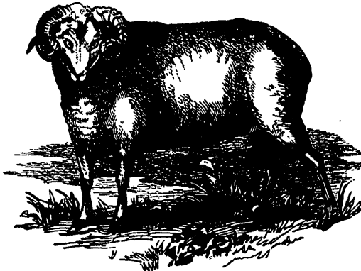
IMPROVED CAPE SHEEP.

a breed which, for symmetry and wool, are a most decided improvement.