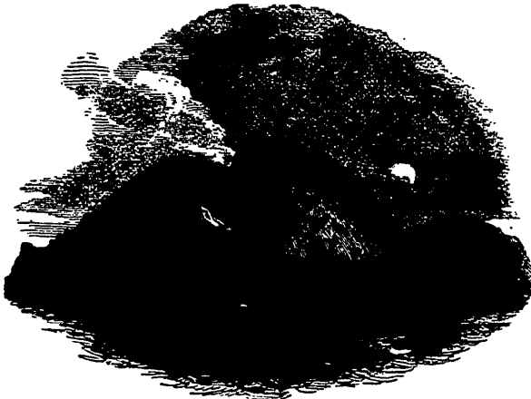
ISLET OF SANTA CRUZ , IN ALGOA BAY.

Diaz did not discover what is properly called the Cape until his return, having been sufficiently to the southward to pass it, in safety, and the part of the coast first made by him was Algoa Bay, where he anchored and remained some time, and being