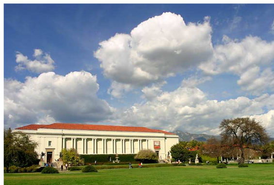
The Huntington Library, California

During my three week Fellowship trip, I had intensive and detailed discussion about two possible approaches to end to end archival management. The Archivists Toolkit - an open source software suite being developed by five universities in America with the assistance of close to US$2 million from the Mellon Foundation - is in early stages but has great promise, and almost everything that is on my 'collection management shopping list' was catered for.