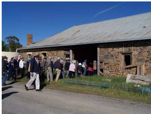
Rubblestone Barn at Nanima