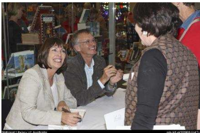
The Wheelers signing books for their fans

It is the attention to detail that has made the Lonely Planet books such a success, down to such matters as the binding. Determined that their guides would not fall apart like some of those produced by their competitors, the Wheelers insisted from the beginning on production methods that ensured their books stayed in one piece.