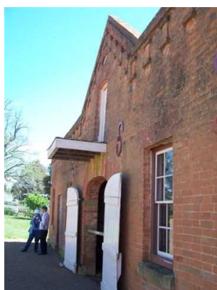
Stables at Cooma Cottage

Before we walked on to the Soldiers' Club for a delicious (and applauded) lunch, a walk down the historic main street of Yass gave us the opportunity to see the development of the town which was ranked in 1858 as the fourth largest in New South Wales.