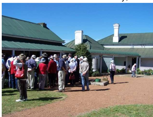
Tour participants at 'Cliftonwood'

majority of travellers through the area came from Sydney, he told us. Most did not journey by mail coach. "The better equipped owned a horse, sometimes two, occasionally hauling a dray with goods or possessions. The majority of travellers from Sydney relied upon their own feet to take them and their swag to Yass or beyond, usually in search of elusive employment, or land, or the lure of gold diggings. Some walked with livestock and a dog. Most did not avail themselves of inn accommodation, with many setting up a temporary camp on the town common alongside the Yass River. Poverty proved to be a feature of many itinerant travellers."