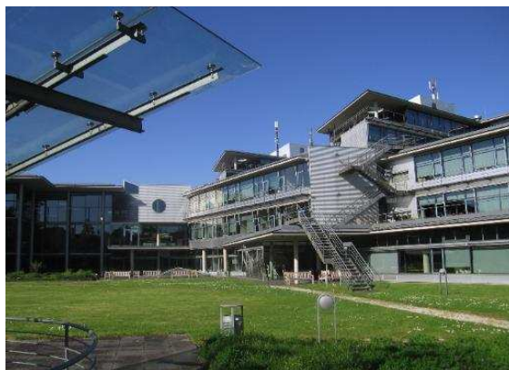
Deutsche Nationalbibliothek gardens, Frankfurt am Main

The DNB and the BnF also demonstrated a number of interesting projects that focus on using names and subjects to increase access to bibliographic records. Of particular interest is the German Personendaten project. Through this project the DNB populates Wikipedia with