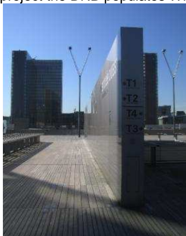
Bibliothèque nationale de France, Paris

names held in the German name authority file and creating links back to records in the DNB catalogue, which makes their catalogue records more accessible on the World Wide Web. As a result of this meeting, People Australia is looking at developing ways of exposing data in online spaces such as Wikipedia, thereby providing users with new pathways to our authoritative resources.