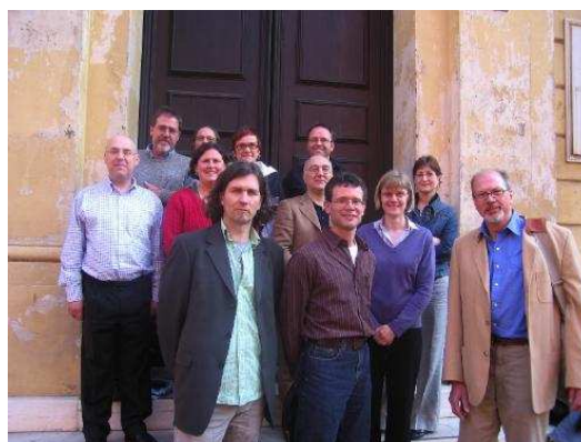
The EAC Working Group, Archivio di Stato di Bologna

People Australia is using a standard called Encoded Archival Context (EAC) to represent and share data about people and organisations. The first aim of my travel was to attend the EAC Working Group meeting to resolve a number of issues with the existing EAC standard.