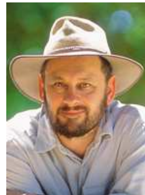
Prof Tim Flannery

Tim Flannery is one of Australia's leading thinkers and writers. He is an internationally acclaimed scientist, explorer and conservationist, and has published a number of books including the landmark works The Future Eaters and The Weather Makers . Professor Flannery is the former director of the South Australian Museum, and is currently a Professor at Sydney's Macquarie University, taking up the Chair in July 2007. He is a founding member of the Wentworth Group of Concerned Scientists, a director of the Australian Wildlife Conservancy, and the National Geographic Society's representative in Australasia. In 2007 Tim Flannery co-founded and was appointed Chair of The