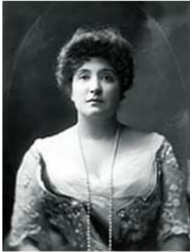
Portrait of Nellie Melba by Henry Walter Barnett

Joseph Joachim; and Melba's silk fan with 25 signatures by famous artists that were associated with her written on the ribs. There are tickets and programs, sheet music dedicated to Melba, letters to her sister, signed photographs and personal items including her silk bag. These all testify not only to Melba's international career and fame but also to her place in Australian history, the place she used to sing about as "Home, Sweet Home".