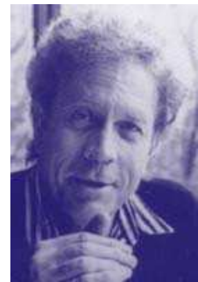
Prof. Henry Reynolds

This conference will be comprised of papers that explore the nature and significance of Reynolds' legacy as well as those which are informed by the latest research and address anew historical questions and historiographical problems regarding the consideration of subjects which Reynolds helped to pioneer.