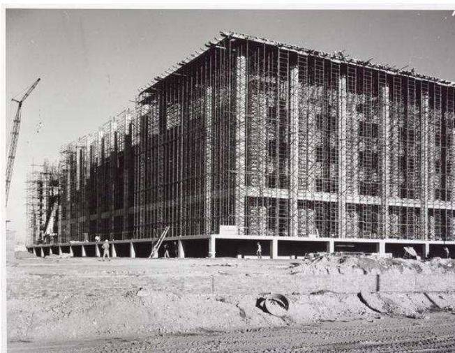
National Library of Australia nla_pic-an24164239 The National Library under construction, June 1966

The final cost of the Library was about $9 million, although many of the lower ground floors were left unfinished. To quote Christine, "Bunning described the library as a contemporary building in the spirit of classical design. He believed the building not only honoured the origins of western culture but was in harmony with the style of buildings depicted in the Griffins' Plan [for Canberra] and was a tribute to colonial architecture. Viewed from a distance, he said, the building looked like a colonial homestead with narrow, white verandah posts".