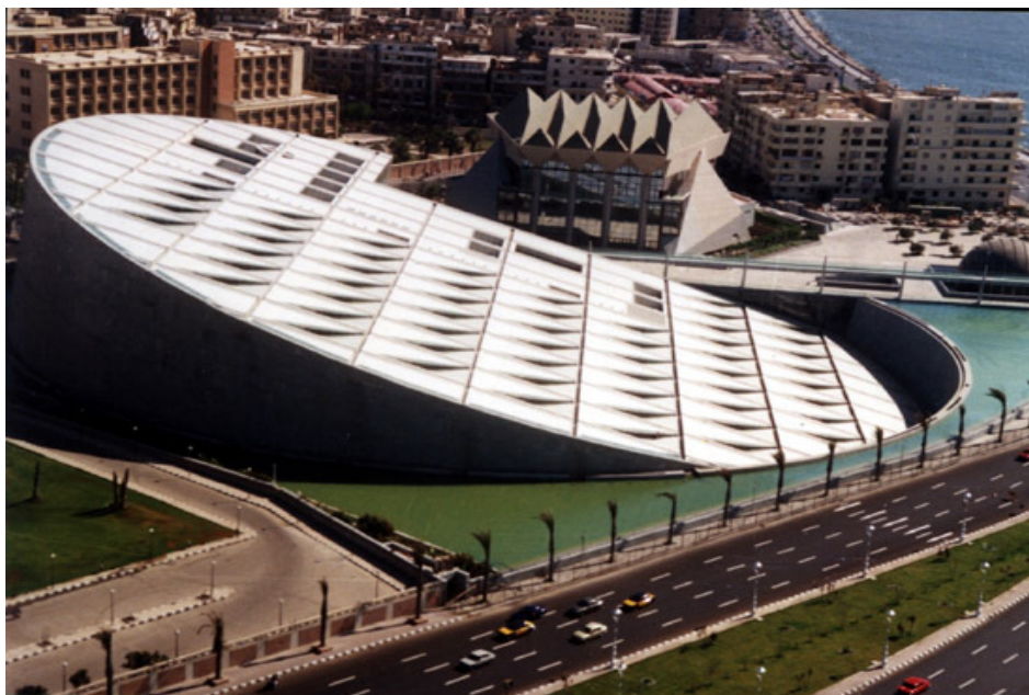
The Bibliotheca Alexandrina

Work commenced on constructing the Library in 1988, on a 35,000 hectare site. The magnificent new building was opened by Egyptian President Hosni Mubarek on 16 October 2002. The total cost was US$220 million.