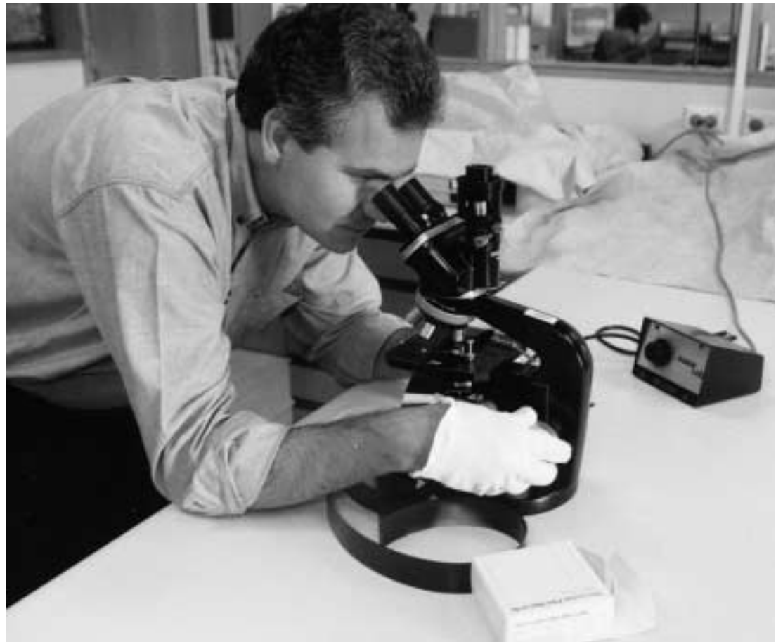
Resolution test chart