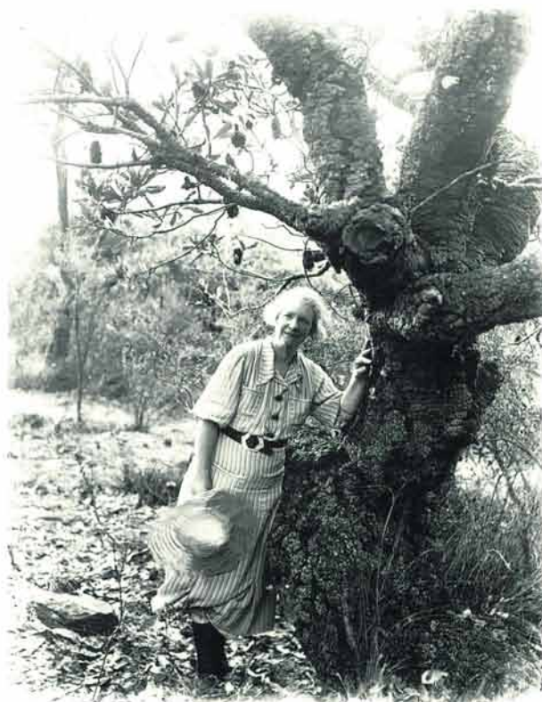
Harold Cazneaux (1878–1953) Margaret Preston (1875–1963), Berowra 1937 print from gelatin silver photograph

But it is not only information about particular individuals that the photographs in the exhibition provide, fascinating as that is (especially when it caters to the contemporary interest in private rather than public lives). As a group the portraits have other stories to tell—about the changes in photographic practice that occurred in the period 1900s to 1970s and about the changing image of the artist in Australian society. The former can be seen in the move away from studio or formal portraiture to more informal modes, especially as subjects become more used to being photographed. The photographs from the 1920s and 1930s are remarkably similar in stylistic terms, recalling traditional portraiture in oils. The subject is generally positioned centrally within the composition, extraneous details are eliminated, the lighting is well controlled and the tones of the print beautifully modulated. These are works by name photographers, such as Jack Cato, Harold Cazneaux and May and Mina Moore, whose professionalism was marked by consistency of style.