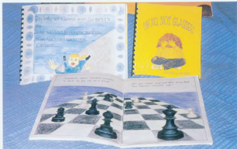
Make Your Own Storybook Competition entries, Children's Book Week, 1994

and ideals of the different periods of history. It forms a yardstick for the growth of theories of learning and teaching, and the form in which this literature appears repays study by those interested in art, typography, design and aesthetics.