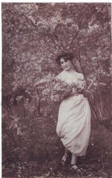
Archibald James Campbell (1853–1929) [Scrub Wattle ( Acacia leprosa )] [between 1896 and 1903] albumen photograph; 20.4 x 12.7 cm Pictures Collection nla.pic-an24232230

auction, and it is often necessary to do historical research, and write a proposal and see it through the various approval processes, at a breakneck pace. The auction of the Freycinet Collection in London in September 2002 was one such event. The paintings and maps to be auctioned were made during French voyages to Australia in 1800–04 and 1817–20; their beauty and rarity brought interest from many Australian institutions and private collectors. A complicating factor was the discrepancy between our limited acquisitions budget and the high price estimates in the catalogue. My colleague, Map Curator Maura O'Connor, and I churned out the necessary written arguments and added restrained excitement and looks of mute appeal designed to win over senior management. A rapid campaign by the Library to secure donations from Library supporters gathered enough funds for a number of strong bids. The result was more than worth the effort. Lots 91 and 92 fell to us, and we added four rare bird paintings by Arago, Taunay, Bevalet and Oudart, and a drawing of an Aboriginal burial ceremony in 1819 to the Pictures Collection.