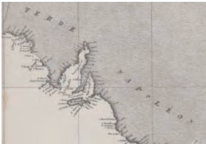
Louis de Freycinet (1779–1842) Carte générale de la Nouvelle Hollande Paris: 1811 hand-coloured engraving; 46.4 x 71.5 cm MAP RaA 1, plate 1 (detail)

2006 marks the 400th anniversary of Dutch landfall in Australia. Throughout the year, notable charts from the Library's Map Collection will be featured individually in the Visitor Centre.