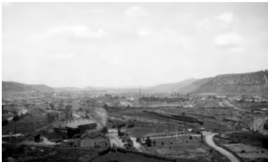
above left: Unknown photographer Zigzag Railway, New South Wales [between 1870 and 1899] albumen photograph; 14.4 x 20.1 cm Pictures Collection nla.pic-an23763175