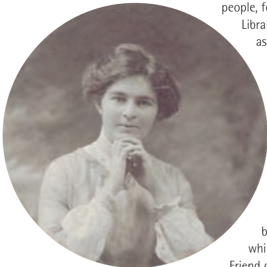
above: Unknown photographer Portrait of Nettie Palmer (then Nettie Higgins) 1912 sepia toned photograph; 4.6 cm diam. Pictures Collection nla.pic-vn3584653