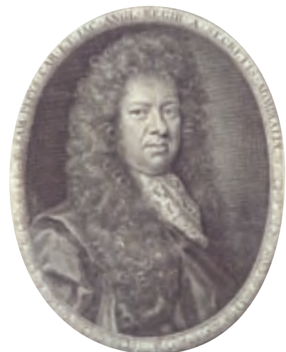
below: Robert White (1645–1703) Portrait of Samuel Pepys London: 1690 engraving; 14.1 x 8.8 cm Pictures Collection nla.pic-an9814330