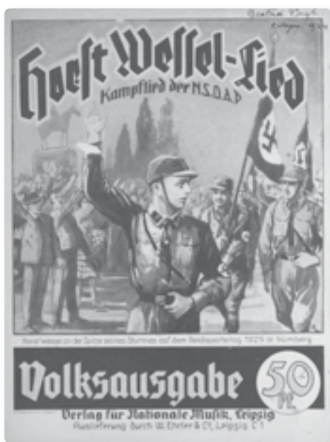
Cover of 'Horst Wessel-Lied: Kampflied der N.S.D.A.P.' (Leipzig: Verlag für Nationale Musik, c. 1929)

The provenance of the photo in the National Library is unknown, but it probably came to the Library through the dispersal of property seized from the German Club in Adelaide at the outbreak of World War II.