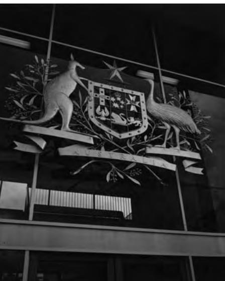
below: Australian Coat of Arms, ACT Supreme Court, Canberra, 1963 gelatin silver photograph 21.0 x 25.0 cm Pictures Collection nla.pic-an14052865-12

The new arms, those we have today, were gazetted in 1912.