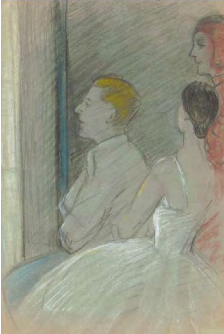
Enid T.L. Dickson (1895–1967) Fokine and Dancers in the Wings, Covent Garden Russian Ballet, 1938–1939 coloured pastel drawing on velvet paper; 35.8 x 24.2 cm Pictures Collection nla.pic-vn3671453