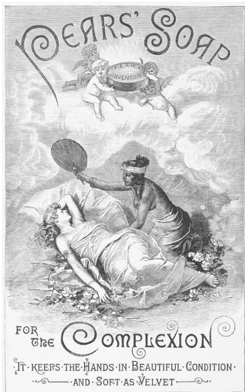
Unknown artist Pears' Soap for the Complexion reproduced from the Graphic , 30 March 1889 (London: Edward Joseph Mansfield, 1889)

Gwen Rankin examines the female form in advertisements, as revealed in the Library's Newspapers Collection