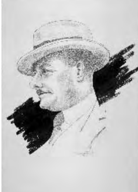
above: A.W. Hawkins Hugh D. McIntosh, 1937 pencil drawing; 50.8 x 32.0 cm Pictures Collection nla.pic-an6054872