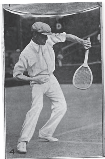
below: Norman Brookes (Australasia) Beating Gore c.1907 reproduced from an untitled album in the Papers of Sir Norman Brookes (1877–1968) Manuscript Collection MS 2979

representative going to partner Brookes', requiring him to be partnered instead by 'a Maorilander'. The National Library of Australia has the Sir Norman Brookes' papers, consisting almost entirely of burly albums of press clippings of stories and press photographs of his playing career. They include, for the year of 1907, clippings that follow him from the first ball he hit in practice after his arrival in England in May to the last ball he hit on 23 July, the last day of the three-day Davis Cup final.