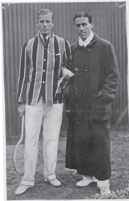
above: Anthony Wilding and Norman Brookes 1907 reproduced from an untitled album in the Papers of Sir Norman Brookes (1877–1968) Manuscript Collection MS 2979