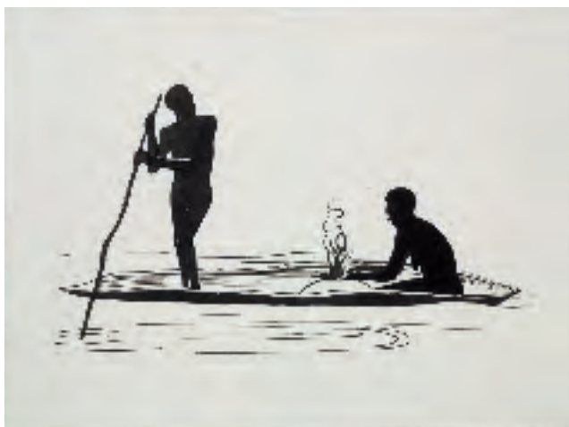
above: Nora Heysen (1911–2003) Billai 1930 pen and ink drawing; 23.5 x 30.5 cm Pictures Collection nla.pic-an23217742