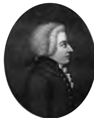
top: Wolfgang Amadeus Mozart Deh prendi un dolce amplesso: Duettino in the Opera of La Clemenza di Tito (London: R. Birchall, between 1824 and 1829) Music Collection, MUS Snell mb 783.12 M939