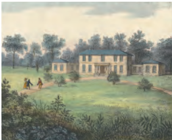
above right: Unknown artist Porto Jackson [Government House at Parramatta] c.1835 coloured print; 10.6 x 13.0 cm

whose father was a friend, but no relation, of Edmund Burke. After successfully completing courses at the Military College at High Wycombe under Major General Robert Brownrigg (Quartermaster-General), Bourke was stationed in Essex before being appointed Superintendent of the Junior Department of the Royal Military College at Great Marlow, near London. He was subsequently gazetted a Major. Courses at Marlow included German, French and Latin, together with natural and moral philosophy. Bourke, already powerfully attracted to the arts and philosophy, also enjoyed London's nearby pleasures, including the musical theatre.