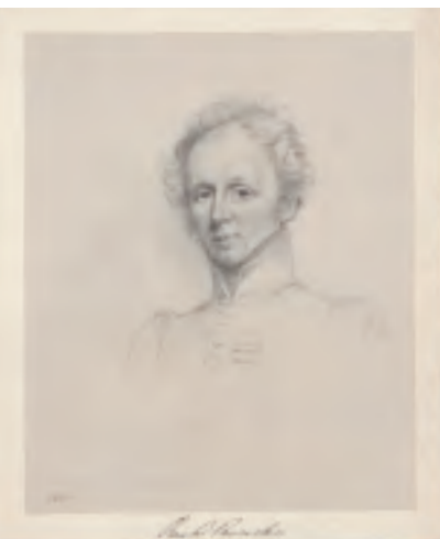
above left: Unknown artist Portrait of Sir Richard Bourke c.1829 lithograph; 22.5 x 18.3 cm Pictures Collection nla.pic-an9455971