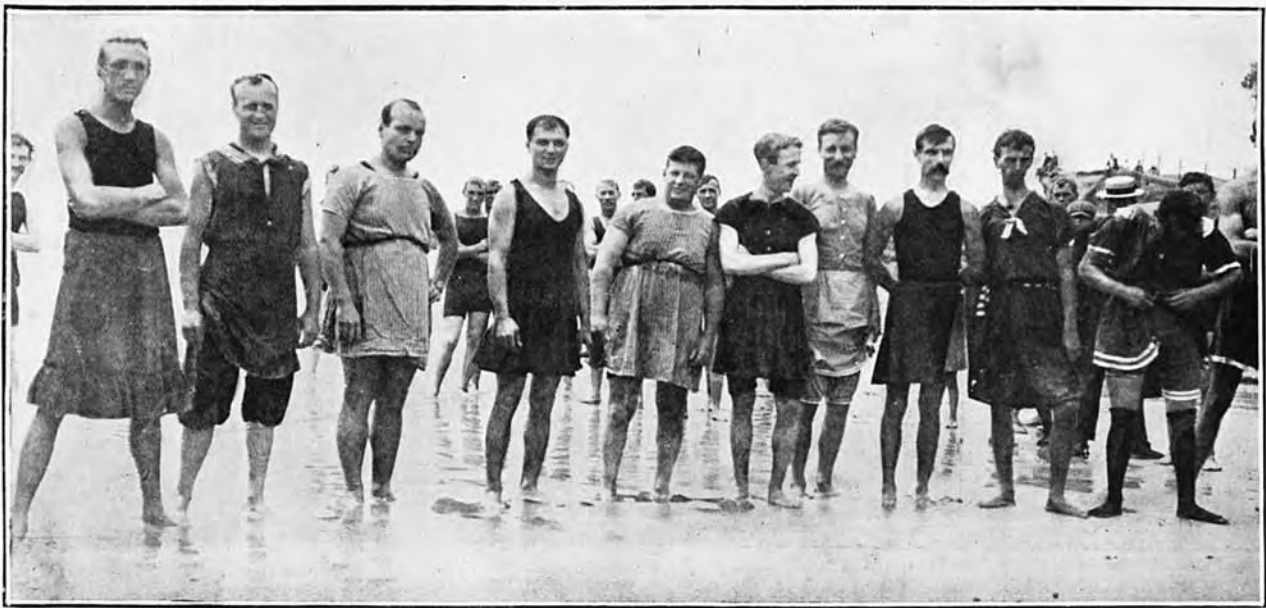
HOW THE MANLY BEACH BATHERS OBEYED THE ORDINANCE.

How the Manly Beach Bathers Obeyed the Ordinance reproduced from the Sydney Mail , 23 October 1907 Newspapers and Microforms Collection mfm NX 182