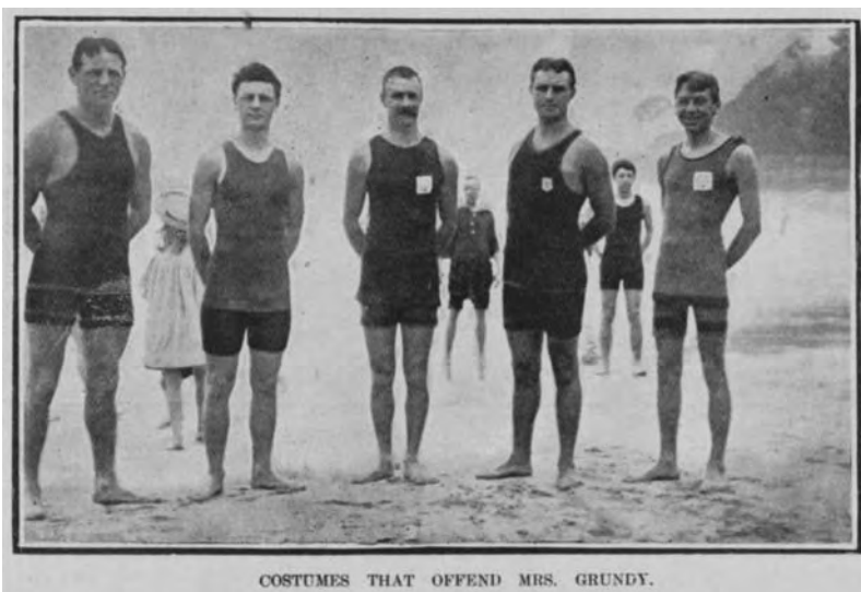
COSTUMES THAT OFFEND MRS. GRUNDY.

This multi-mayoral proposal (real or imagined) was mentioned obliquely at the aforementioned great meeting (the man from the Telegraph reported 'laughter' when the issue was raised) and it seems