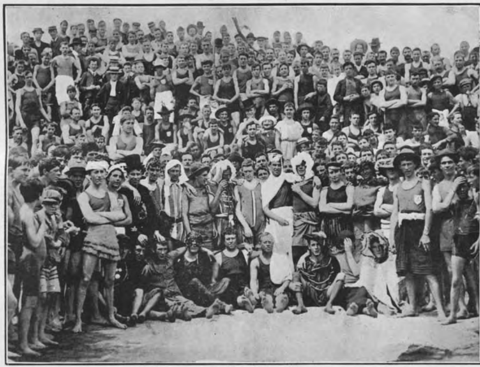
THE SKIRTED BATHERS OF BONDI BEACH.

left: The Skirted Bathers of Bondi Beach reproduced from the Sydney Mail , 23 October 1907 Newspapers and Microforms Collection mfm NX 182