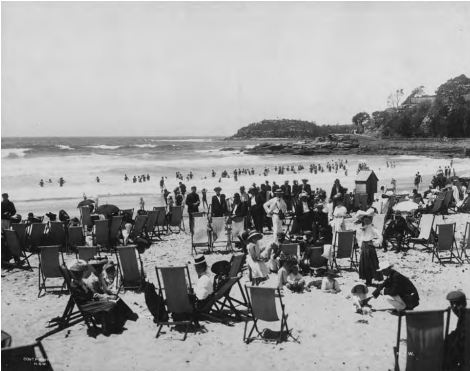
above: NSW Government Printing Office Surf Bathing, Manly Beach, New South Wales 1900 gelatin silver photograph 28.0 x 36.0 cm Pictures Collection nla.pic-an13294757