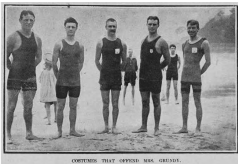
COSTUMES THAT OFFEND MRS. GRUNDY.

This multi-mayoral proposal (real or imagined) was mentioned obliquely at the aforementioned great meeting (the man from the Telegraph reported 'laughter' when the issue was raised) and it seems