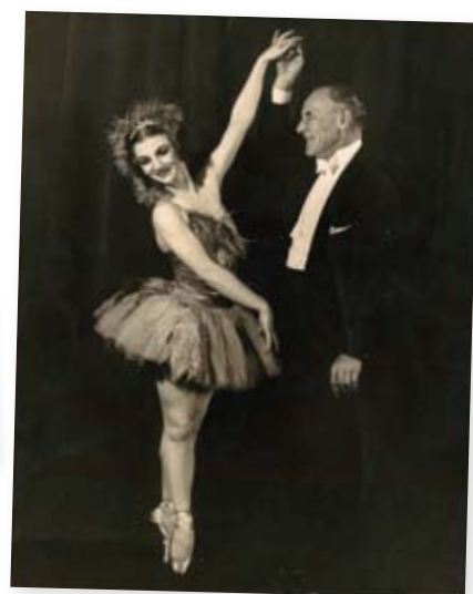
above left: Unknown photographer Tamara Toumanova, Original Ballet Russe Tour to Australia, 1939-40 gelatin silver photograph 17.4 x 13.6 cm Pictures Collection nla.pic-vn3427898