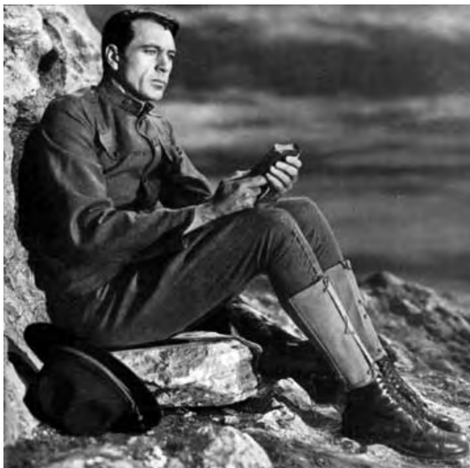
Gary Cooper as Alvin C. York in Warner Bros' 1941 movie, Sergeant York reproduced from Sergeant York by Sam K. Cowan (New York: Grosset & Dunlap, 1922, 1941)

soldiers (the Cape Cod American Legion), but he still lacks the Australian headstone to which he is, I think, entitled.