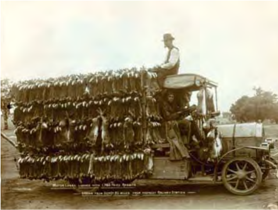
left: Unknown photographer Motor Lorry Loaded with 1760 Pairs of Rabbits, Drawn from Depot 30 Miles from Nearest Railway Station c.1918 albumen photograph 15.1 x 20.4 cm Pictures Collection nla.pic-an24664485