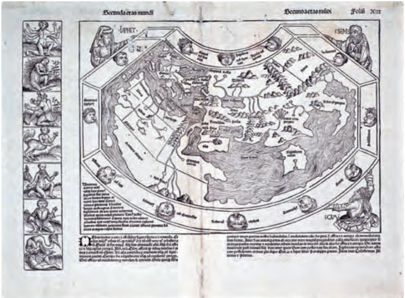
above: Hartmann Schedel (1440–1514) World Map—Secunda etas mundi reproduced from Nuremberg Chronicle, folio XIII (Nuremberg: Hartmann Schedel, 1493) map; 31.0 x 43.0 cm Maps Collection, nla.map-nk6074