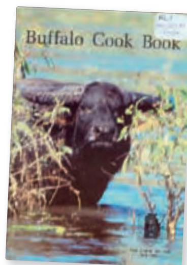
Cover of Buffalo Cook Book (Darwin: Country Women's Association of the Northern Territory, 1981)