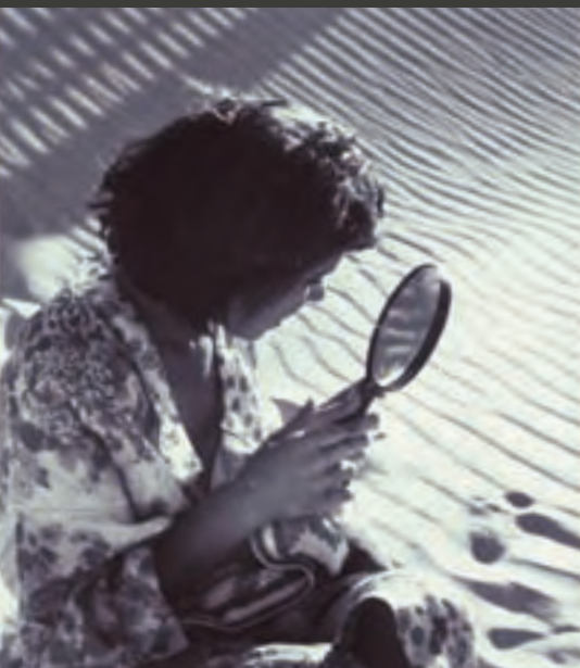
Olive Cotton (1911–2003), Girl with Mirror 1938 gelatin silver photograph, 35.4 x 30.6 cm Pictures Collection, nla.pic-an12824549

From 1 April, go to www.nla.gov.au/events/firstperson for the complete program.