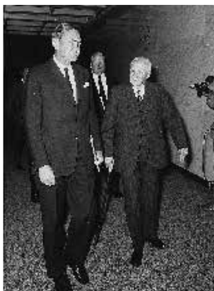
below: Sir John Gorton and Sir Archibald Grenfell Price b&w photograph; 20.9 x 15.4 cm Pictures Collection nla.pic-vn4387972