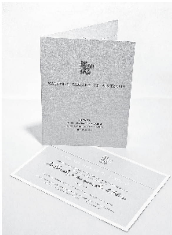
below: Invitation and menu to the opening dinner at Burton Hall Ephemera Collection