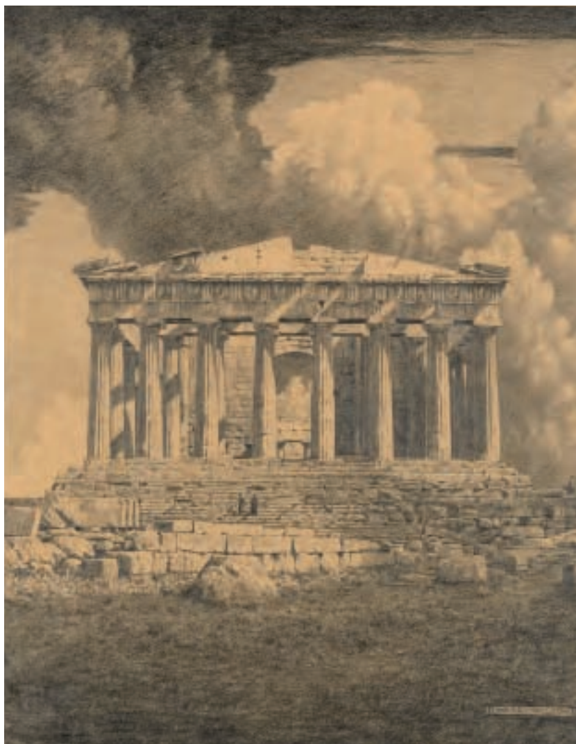
above: Hardy Wilson (1881–1955) The Parthenon c.1925 pencil; 45.5 x 35.0 cm Pictures Collection nla.pic-an2769344