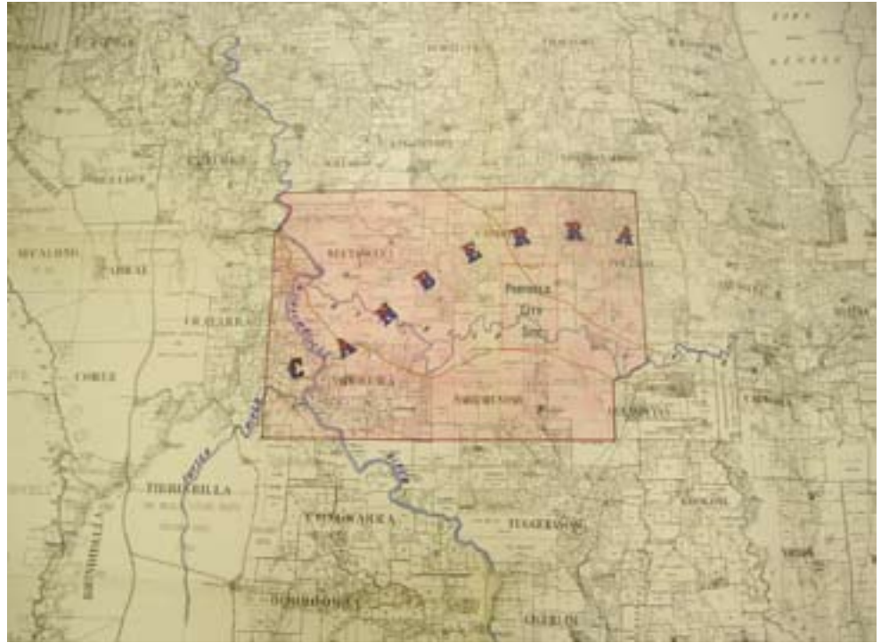
W.L. Vernon and A.L. Lloyd The first published map solely devoted to a capital site called 'Canberra' 1906 [detail]

Gundagai and Goulburn. Interestingly, Premier Carruthers and his cabinet left the hunt to the highly regarded engineers, surveyors, and architects working within New South Wales bureaucracy—the Department of Public Works specifically.