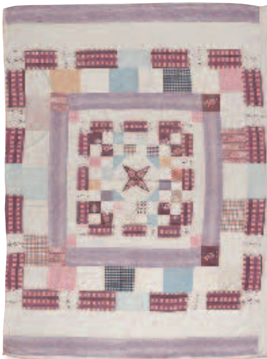
Patchwork quilt made by Aboriginal children in Western Australia, c.1845 cotton; 105.0 x 139.5 cm Pictures Collection nla.pic-an7828946