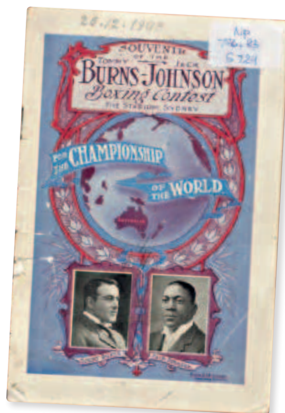
above: Cover of the souvenir program for the Burns-Johnson championship fight (Sydney: 1908)