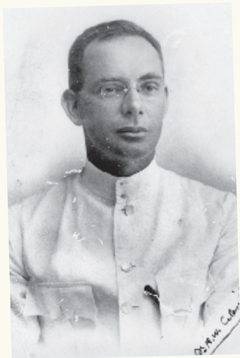
Unknown photographer Sir Raphael West Cilento, 1923 b&w photograph John Oxley Library image no. 186000 Courtesy State Library of Queensland