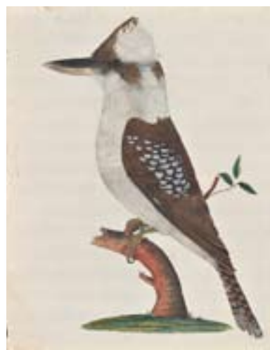
George Raper (1769–1796) [Laughing Kookaburra ( Dacelo novaeguineae ) 1789?] watercolour; 40.7 x 32.0 cm Pictures Collection nla.pic-vn3579224

This work and other Raper paintings were copied by his superior officer, Captain John Hunter, for his 'Birds & Flowers of New South Wales, Drawn on the Spot in 1788, '89 and '90', held in the Library's Rex Nan Kivell Collection. Raper's kookaburra toured Australia as part of the Library's National Treasures exhibition, 2005–2007.