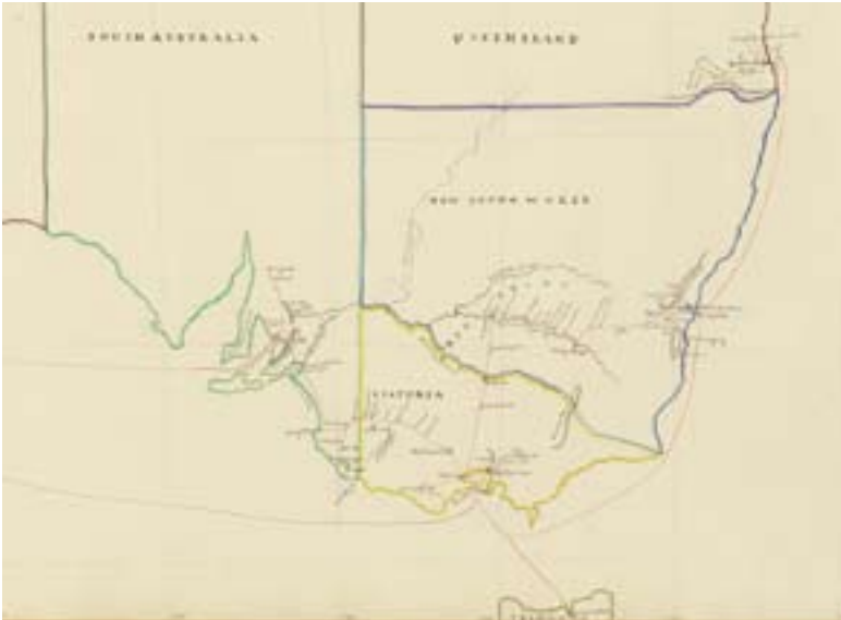
above: Stanley Leighton (1837–1901) Map of Tour of Australia (detail) 1868 watercolour & coloured ink on paper; 35.8 x 50.0 cm Pictures Collection nla.pic-vn4330098