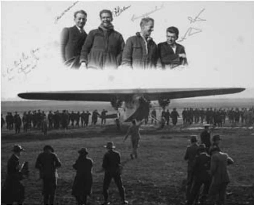
above: Broughton, Ward & Chaseling The Southern Cross on Its Arrival in Sydney from the Flight across the Pacific, 10 June 1928 b&w photograph 30.9 x 38.6 cm Pictures Collection nla.pic-an24664462