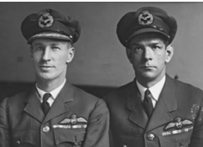
above: Sydney Morning Herald/ Sydney Mail Charles Kingsford Smith with Charles Ulm, Taken Just after the Trans-Pacific Flight, 1928 b&w photograph 11.3 x 16.0 cm Pictures Collection nla.pic-an2411366