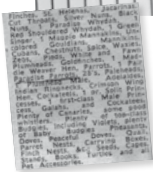
top: Fakes: a hybrid pair of 'paradise' parrots (female at right), and the advertisement by a Nunawading birdseller in the early 1970s