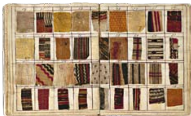
James Cook (1728–1779) Patterns of Cloth Made and Wore [i.e. worn] by Natives of the South Sea Islands Being Part of the Collection Made by the Celebrated Circumnavigator Capt. James Cook in His First, Second and Third Voyages reproduced from Patterns of South Sea Cloth , 1768–1774 Manuscripts Collection, MS 4299g nla.ms-ms4299g

During his three South Pacific voyages, Captain James Cook collected the 70 samples of bark cloth, or tapa, contained in this book. Tapa was traditionally made throughout the islands of the South Pacific from the bark of trees such as the paper mulberry or breadfruit tree. Decorated with distinctive designs, it was used to make clothing, bed covers, mats and garments for ceremonial purposes. Each sample in Patterns of South Sea Cloth measures about 5 cm x 9.8 cm and a list corresponding to the samples includes place of origin, methods of manufacture, the likely wearers and the uses of the cloth.