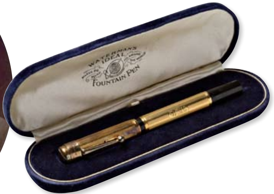
above right: William Morris Hughes' Fountain Pen in its Case Manuscripts Collection MS 1538, Series 50

stories in England and some of his work was published, but, as reported in the Australian Dictionary of Biography (Online Edition), 'Lawson himself in later years provided fuel for the idea that his English interlude, so eagerly anticipated, was in fact a catastrophe: "Days in London like a nightmare"; "That wild run to London/That wrecked and ruined me".'