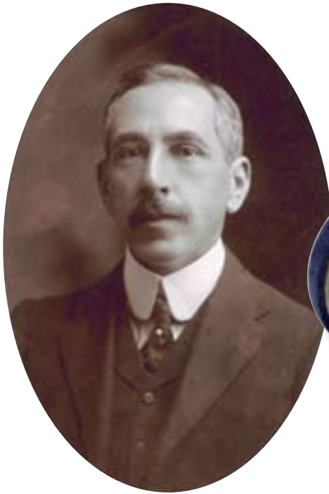
above left: T. Humphrey & Co. Portrait of W.M. Hughes 1908 sepia-toned gelatin silver photograph; 12.5 x 8.5 cm Pictures Collection nla.pic-an23366522