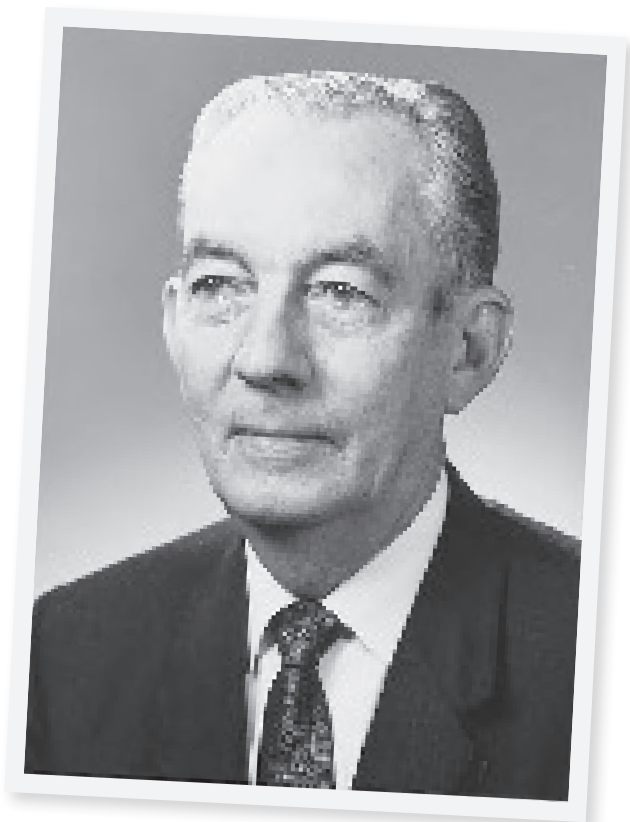
Mr James Francis Cope, Speaker in the House of Representatives of the Australian Federal Parliament 1973 b&tw photograph; 21.6 x 16.5 cm