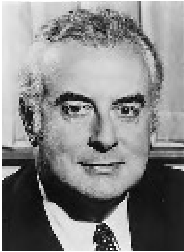
above: Portrait of Gough Whitlam, Prime Minister of Australia, 1972-1975 [between 1972 and 1975] b&w negative