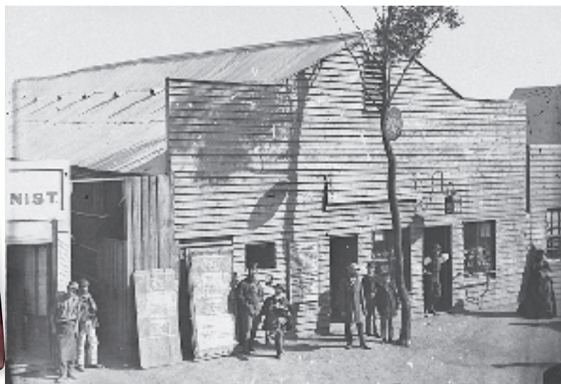
below right: American & Australasian Photographic Company Charles Guigini's Jewellery Shop, Gulgong Mercantile Advertiser Office and John Congdon's Prince of Wales Theatre, Gulgong c.1872 quarter plate glass photonegative Courtesy State Library of New South Wales, Holtermann Collection, PXA 4999