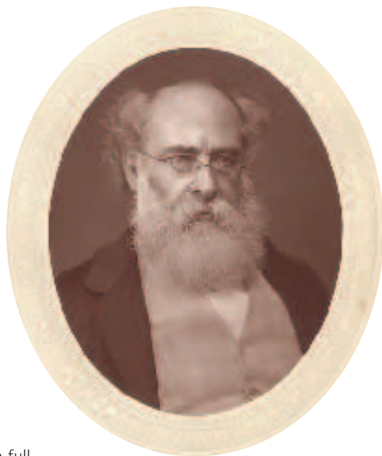
above: Lock and Whitfield Anthony Trollope c.1877 woodburytype photograph 11.7 x 9.4 cm Pictures Collection nla.pic-an24722350

After a brief stop in Melbourne and a tour of Queensland, Trollope headed down the coast to Sydney, receiving a more circumspect welcome in The Sydney Morning Herald editorial column. He carried the same last name, it warned, as 'a lady who travelled