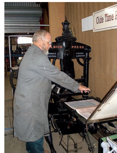
above: Gulgong Pioneer Museum's Albion Press, made in 1869 and used to print the Gulgong Mercantile Advertiser at the time of Trollope's visit