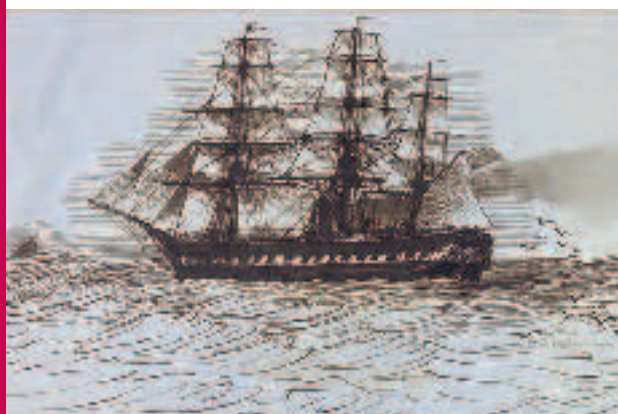
below left: George Gordon McCrae (1833–1927) The Great Britain 1860s pen and ink; 11.5 x 19.0 cm Pictures Collection nla.pic-an6326825