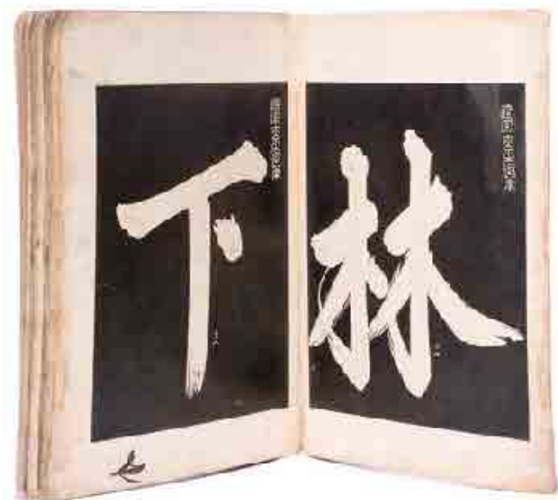
An example of royal calligraphy, depicting the characters for 'under' (left) and 'forest' (right) reproduced from Yölsöng öp'il , a book of calligraphy rubbings by successive Korean kings from 1392 to 1724 (Hansöng: s.n., c.1725)

such a Korean tribute mission to the Chinese court.