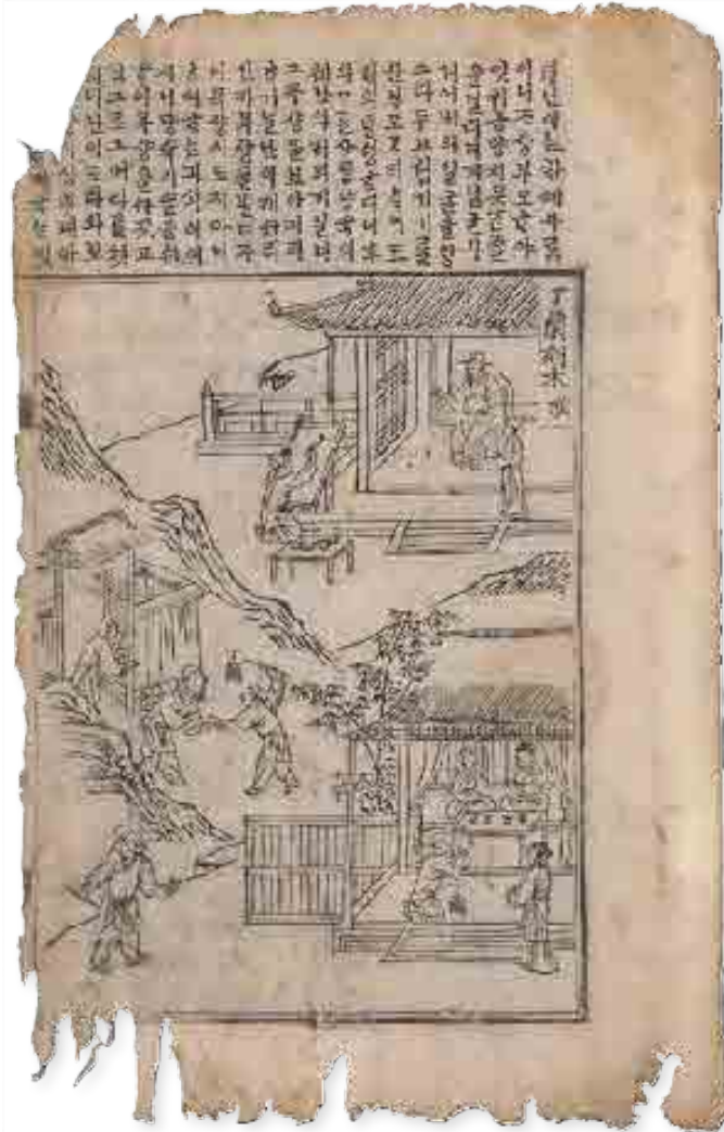
above right: Illustrated page from Samgang haengsilto ('The Three Principles of Basic Human Relations') (Korea: 1729)