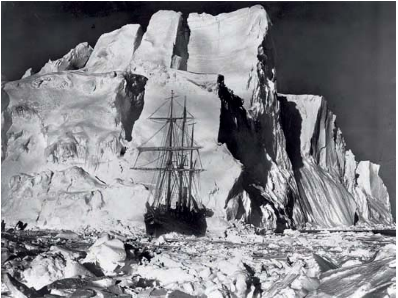
Frank Hurley (1885–1962) A Mighty Iceberg Ploughed Its Way through the Pack and Bore Down upon the Imprisoned Ship 1915 plastic negative; 12.0 x 16.0 cm Pictures Collection nla.pic-an23998521

there—that it was an unpeopled landscape. And yet vast areas of the Kimberley qualify as wilderness while being used: it is a landscape somewhat changed since white settlement but, in comparison with southern Australia, little changed over the millennia.