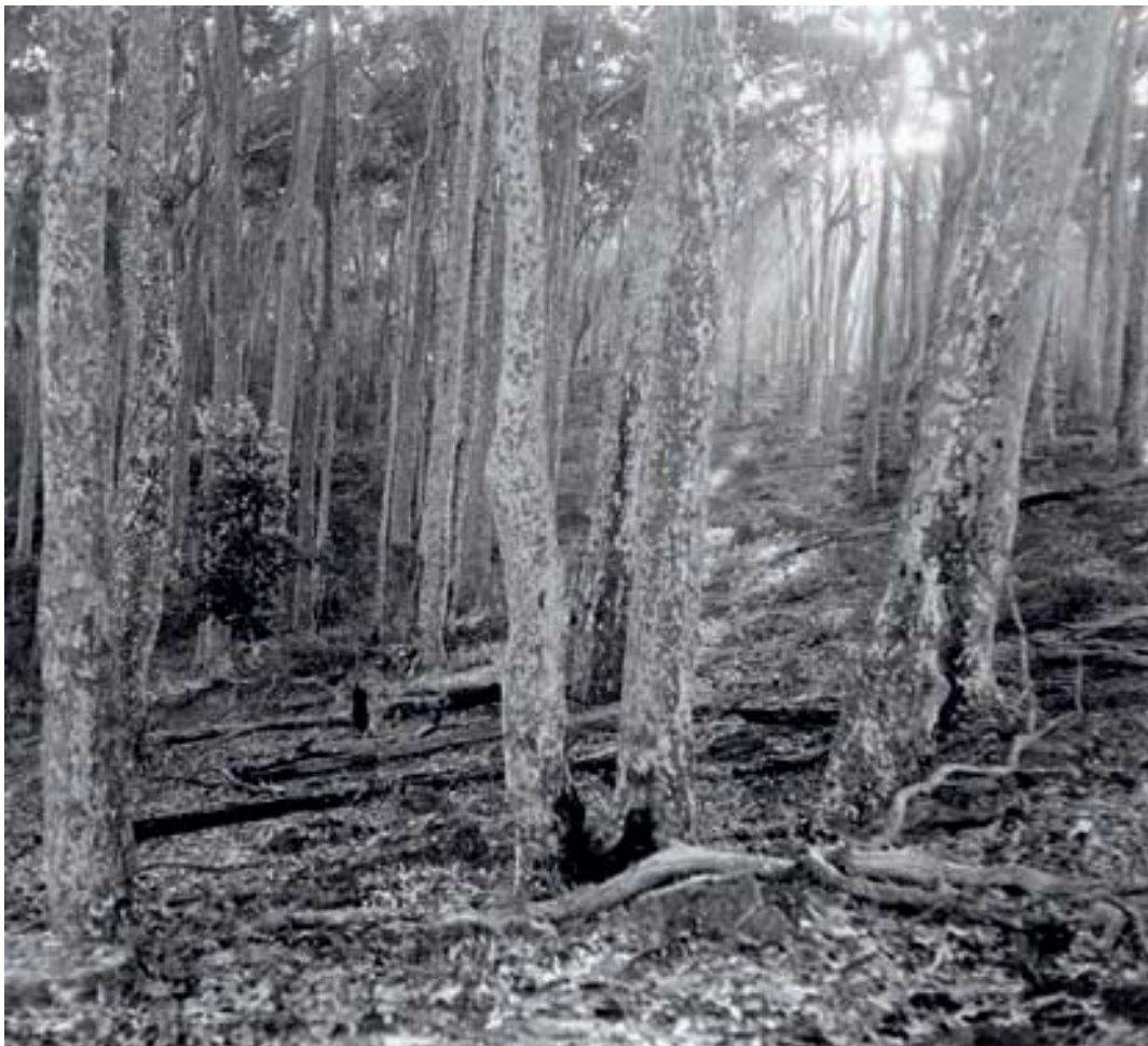
LEFT Olive Cotton (1911–2003) The Way through the Trees 1938 gelatin silver photograph 28.4 x 31.6 cm Pictures Collection nla.pic-an12819173