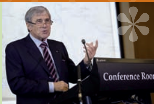
Mr Kerry Stokes AC addressing guests at the presentation of four rare Dutch United East India Company charts on 13 August 2009, National Library of Australia