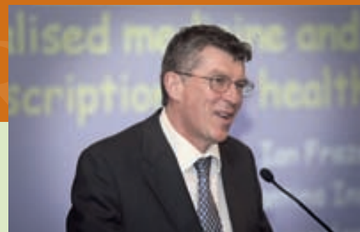
Professor Ian Frazer presenting the 2009 Kenneth Myer Lecture

As the four charts on loan are undergoing extensive preservation treatment prior to display, they cannot be immediately viewed.