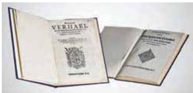
ABOVE Two seventeenth-century propaganda pamphlets in the Kern Collection: Waerachtich verhael, van 'tgeene inde Eylanden van Banda, in Oost-Indien ... 1622 (right) and Waerachtich verhael vande Tijdinghen gecomen uit de Oost-Indien, met het jacht ghenaeamt de Haze ... 1624 (left)