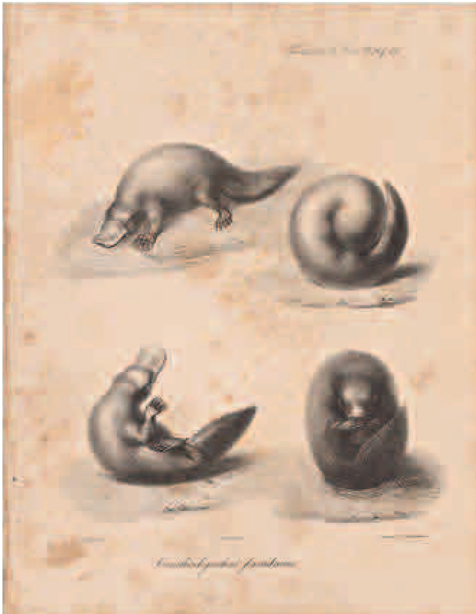
ABOVE G. Schoorf Ornithorhynchus paradoxus Sketched in Postures Which It Assumes while Sleeping, Partially Awakened, Combing Itself, and Feeding c.1835 plate 34 reproduced from 'Notes on the Natural History and Habits of the Ornithorhynchus paradoxus , Blum' by George Bennett, in Transactions of the Zoological Society of London , vol. 1 (London: Zoological Society of London, 1835)

liquid produced from these simple glands was not milk; at best, it was a nutritious mucus eaten by the young or perhaps a secretion dispersed in the water for the young after hatching. Alternatively, like the odiferous musk glands of the shrew, the liquid could be designed to attract a mate. Finally, he suggested it was carbonate soda to form a shell around the egg.