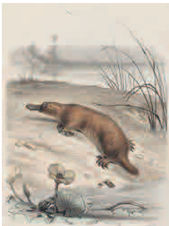
LEFT Edouard Traviès (1809–?) L'Ornithorhynque 1860s coloured lithograph 25.1 x 17.1 cm Pictures Collection nla.pic-an11333616

of science and with the current absence of observations, that the Zoological Society of London obtain microscopic evidence of the secretions of the monotreme milk from the field for his examination.