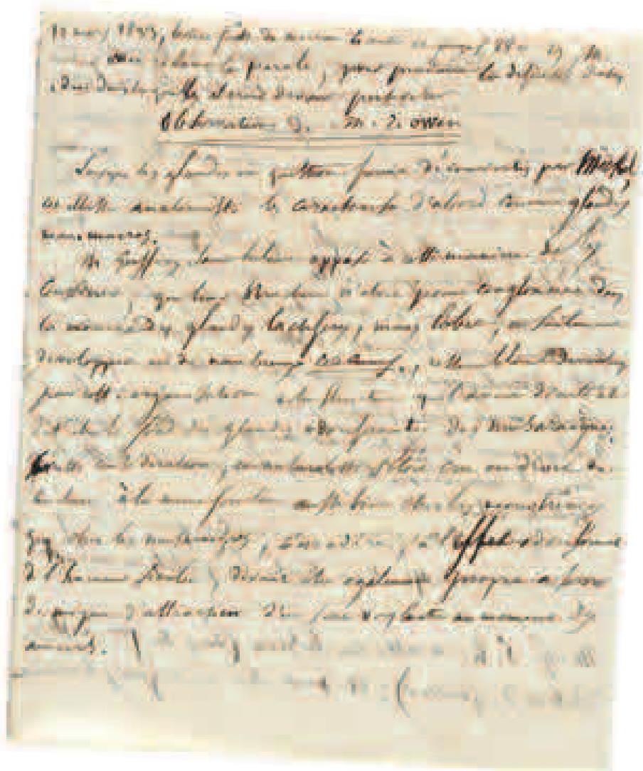
ABOVE The first page of ' Nouvelles Considérations sur la nature des Glandes abdominales des Monotrèmes ' (1833) by Étienne Geoffroy Saint-Hilaire Manuscripts Collection MS 10038

The stakes in the battle had risen but Geoffroy was not to be vanquished. Confident for 30 years that the monotremes were an egg-laying duo of a reptilian nature belonging to the order of Monotremata, he was certain of one thing—egg-laying (oviparity) decreed an absence of mammae. It was wholly unnatural, he insisted, to have a mammiferous, milk-producing, egg-laying animal—an amphibian mammal—it went against the 'all-powerful rules, the very plan of nature'. Swift off the mark, he published this opinion in a memoir in France's Gazette Medicale in January 1833 and, as a Foreign Member of the Zoological Society of London, despatched a copy of it in March for discussion in the Society's Proceedings . Pushing his thesis that the young could not suckle from a breast that lacked a nipple, Geoffroy rehearsed his argument: the