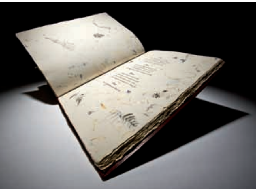
ABOVE The pages of Keith Bosley's translation of The Song of Songs are embedded with flowers and leaves Rare Books Collection RB1 223.9 B582