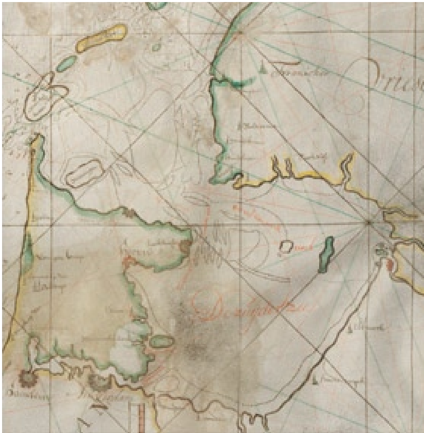
ABOVE Isaac de Graaf (1667–1743) From the Netherlands to the English Channel (detail) Loan courtesy Mr Kerry Stokes AO